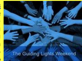
The Guiding Lights Weekend

conference on life-long learning, community-building and the art of citizenship, sparking civic imagination and social change by bringing together leaders, catalysts, and innovators in creative ways to generate new solutions to collective challenges. Our focus will be on helping neighbors build a strengthened personal base from which to extend to community, starting with neighborhoods and eventually leading to modeling for broader groups.